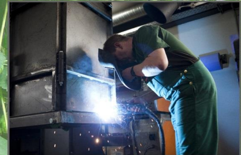
Production in our manufacturing department