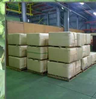
Rectangular bales (about 80 kg)