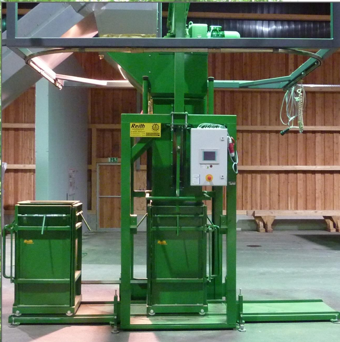
Ready to press – Reith Hop Baler 3000