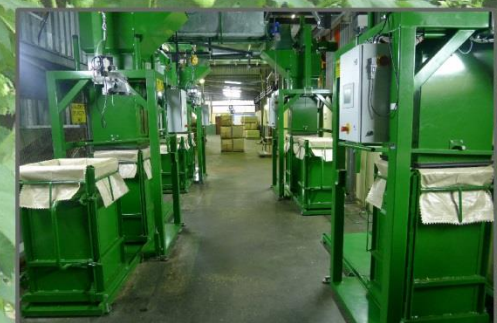
4 Hop Balers at a hop farm in South Africa